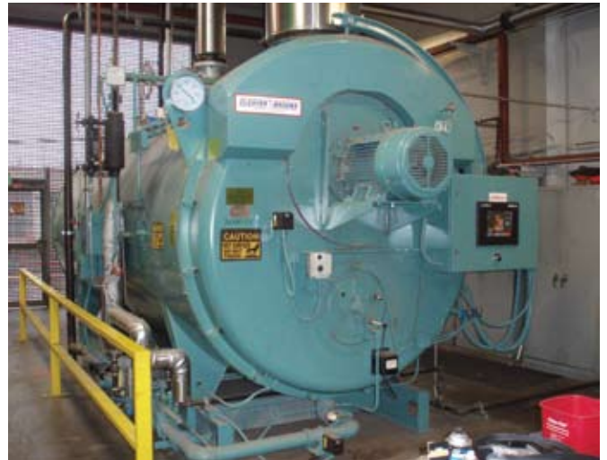
Upgraded controls on an industrial boiler

speed burner fans. The Program recommended that the new, lower NOx burner be upgraded from standard-efficiency burner and fans controls to parallel positioning and a burner fan variable frequency drive (VFD). By providing more precise digital control of the fuel and air inputs throughout the firing range, this project will increase the combustion efficiency